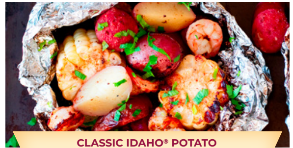
CLASSIC IDAHO® POTATO LOW COUNTRY BOIL GRILL PACKETS

Idaho has over 10,000 acres dedicated to growing red potatoes.