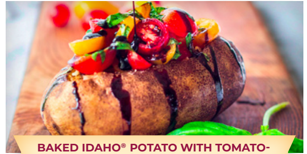
BAKED IDAHO® POTATO WITH TOMATO-BASIL RELISH AND BALSAMIC DRIZZLE

Idaho's most popular potato! Idaho farmers have been perfecting these beauties since the 1880s.